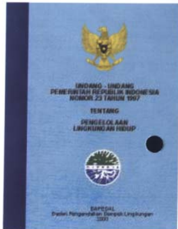
Maximal value from industrial wasted