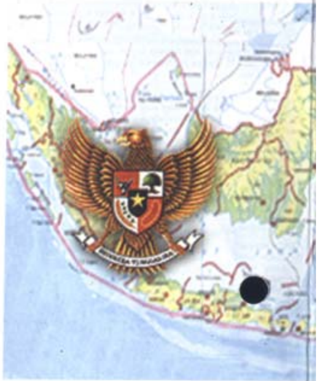
Analyze gap in meeting Indonesian government